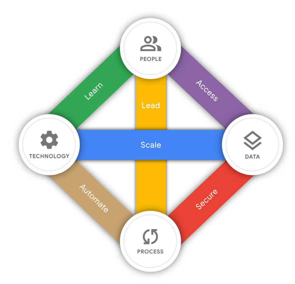
Figure 1: The Al maturity themes

Google Cloud's Al Adoption Framework is anchored in the familiar rubric of people, process, technology, and data. The interplay between these four key areas gives rise to six themes: Learn, Lead, Access, Scale, Automate, and Secure. These themes are foundational to the Al Adoption Framework.